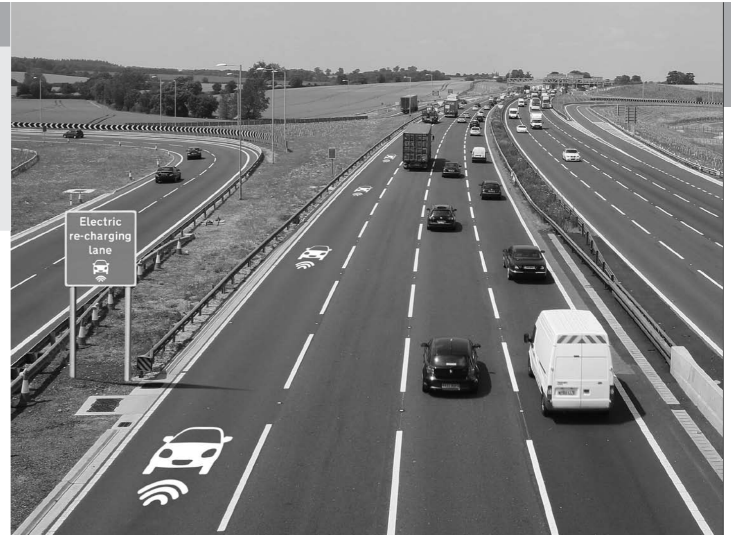
Vision of the near future? The UK's launch of trials has sparked interest around the world

The technology to charge wirelessly through induction while vehicles are stationary already exists and is in operation in several locations around the world. This uses the same principal as an electric toothbrush: a primary coil – under the road – creates a